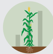
CURRENT CROP GROWTH STAGE