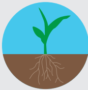
NEXT 7-DAYS WATER USAGE