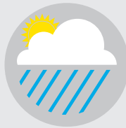
NEXT 7-DAYS PRECIPITATION